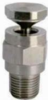
Removable deflector cap 1/8" to 3/8" NPT or BSPT(M)